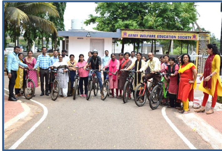
World Environment Day : The school observed World Environment Day on 05 June 2022.